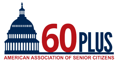
60 Plus Association