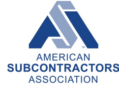
American Subcontractors Association