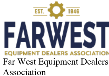
Far West Equipment Dealers Association