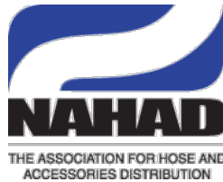
NAHAD The Association for Hose and Accessories Distribution